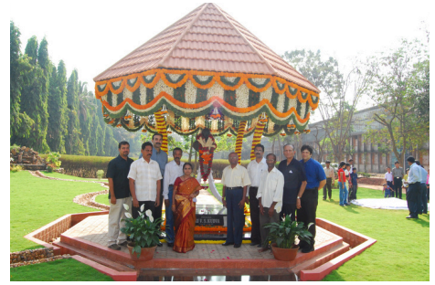
Unveiling of the bus of Shri VS Kudva at VS Kudva Memorial on 26th January 2009 at the Canara Workshops Ltd premises.